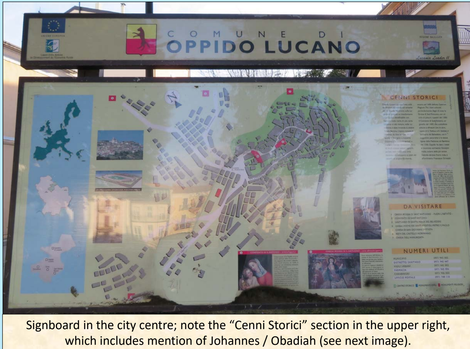
Signboard in the city centre; note the “Cenni Storici” section in the upper right, which includes mention of Johannes / Obadiah (see next image).