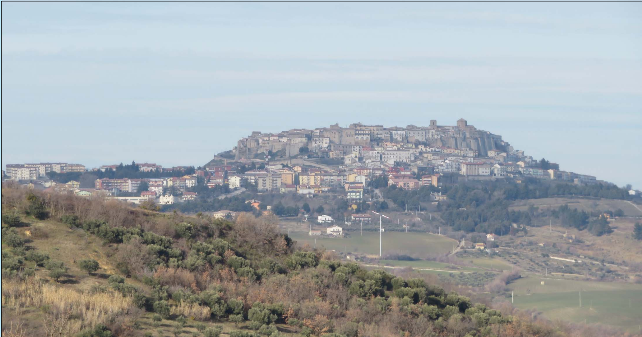
Acerenza (mentioned by Johannes / Obadiah as a town to the north), as seen from afar, on Route SS169.