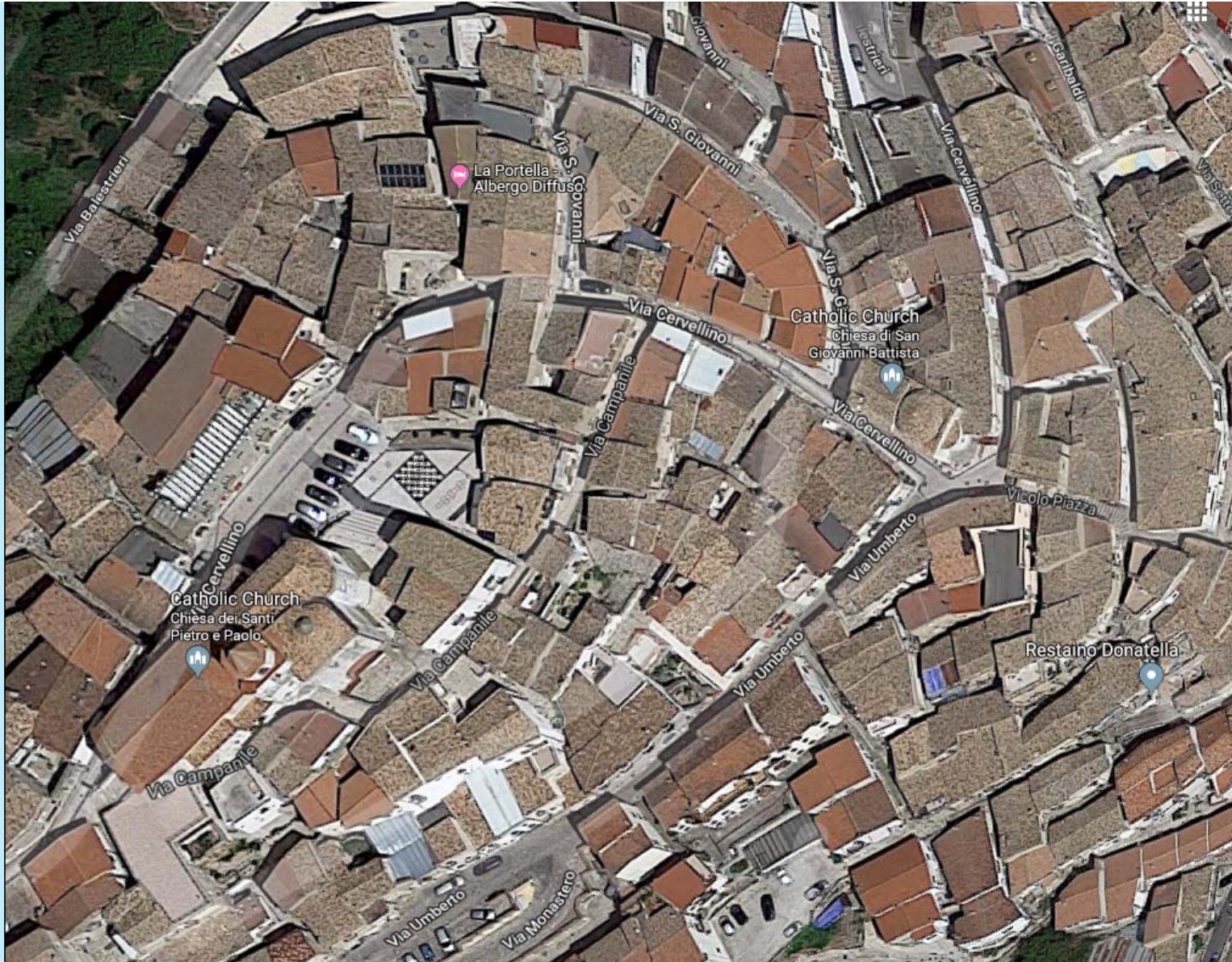
Satellite view from Google Maps (zoomed)