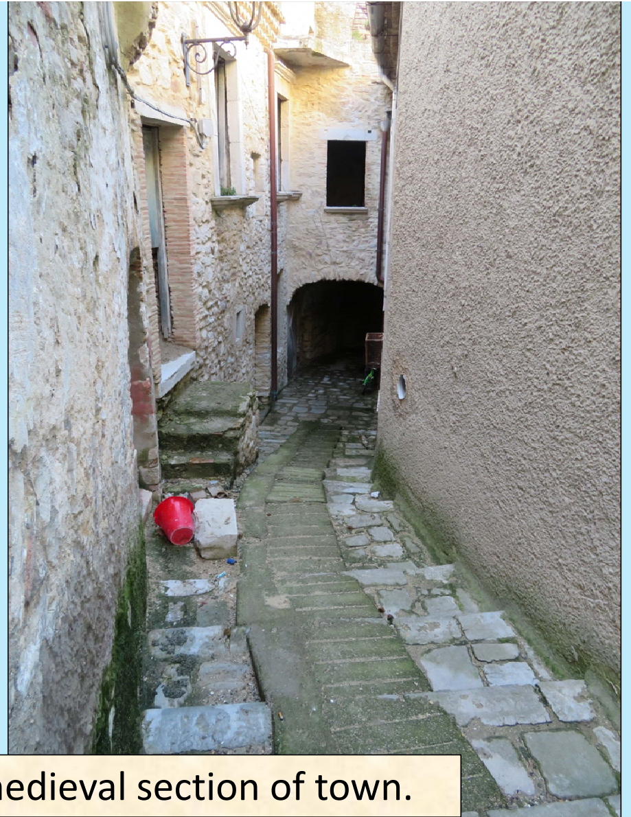
Narrow 'streets' in the medieval section of town.